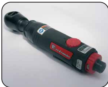
Ratchet Wrench with comfort grip

The new Red Rooster air ratchet wrenches are suitable for use in workshops and are being applied for loosening and tightening threaded bolts in confined spaces. Using these air ratchet wrenches will save you time and the skin on your fingers.